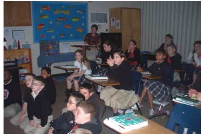
Students in 4th and 6th grades watch the historic final landing of the space shuttle Discovery.

Generous donors made the technology used to observe this historic landing possible. Thank you!