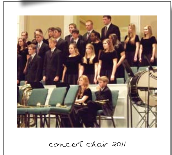
concert choir 2011